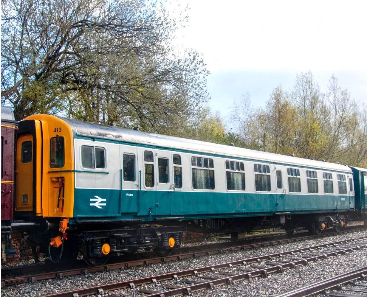
A completed 76275 seen at a recent Barrow Hill open weekend

Thank you for taking the time to read this update and thank you for your continued support.