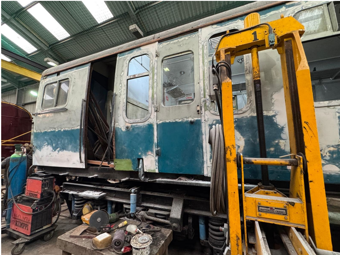
76275 showing the extent of work carried out to the body sides