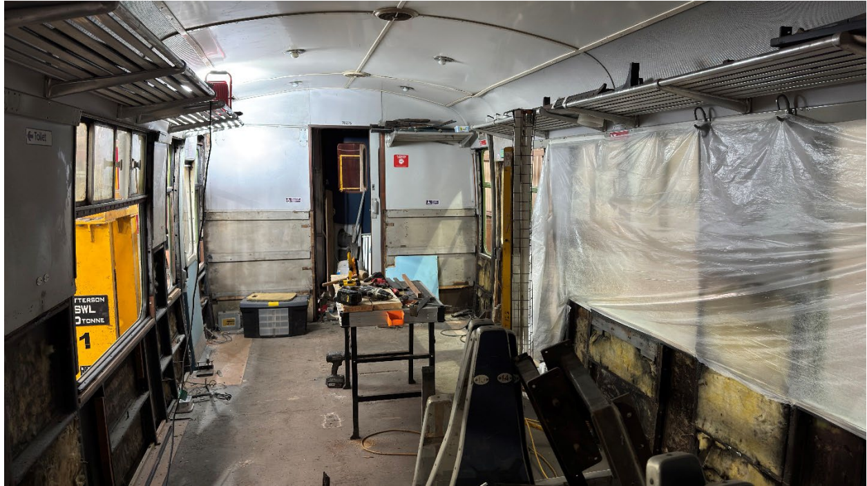
Pictures showing the extent to which the interior was stripped out for repair work to take place