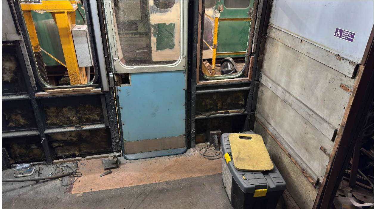
Pictures showing repairs to the floors, including new hardwood door step inserts