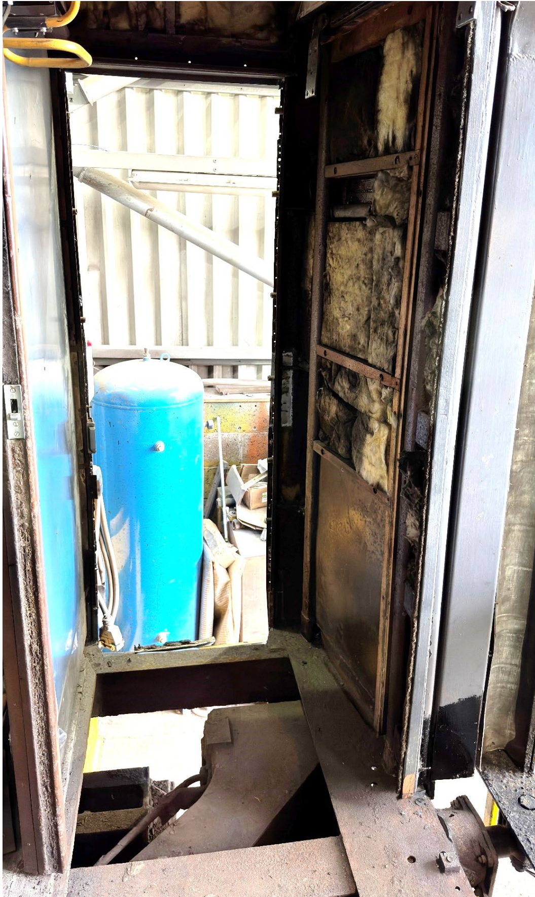
The non-cab end vestibule floor and walls required extensive repairs