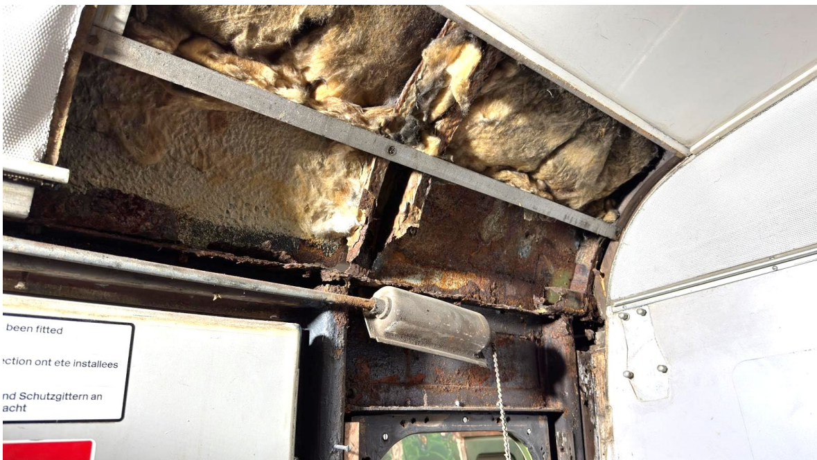
An area of significant corrosion discovered in the roof/ceiling once work had begun. This was down to the failure of a previous poor repair carried out by BR.